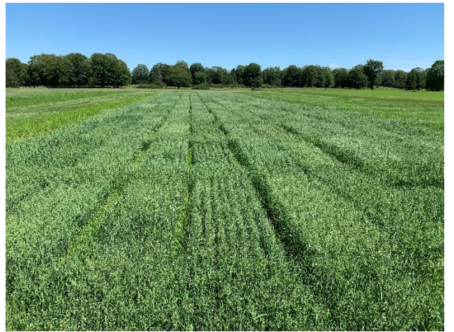
Figure 2. Chatham MCI A oat plots