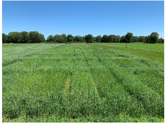
Figure 1. Chatham MCI A barley plots