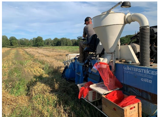
Figure 3. Harvesting barley plots in Chatham